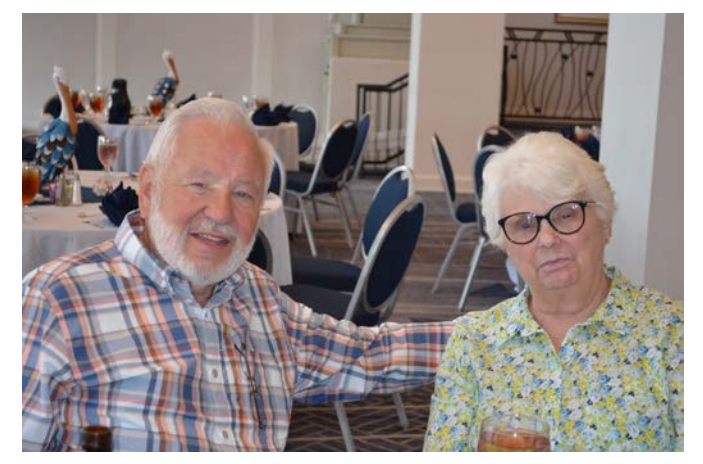
GRAND BANQUET WATERSIDE