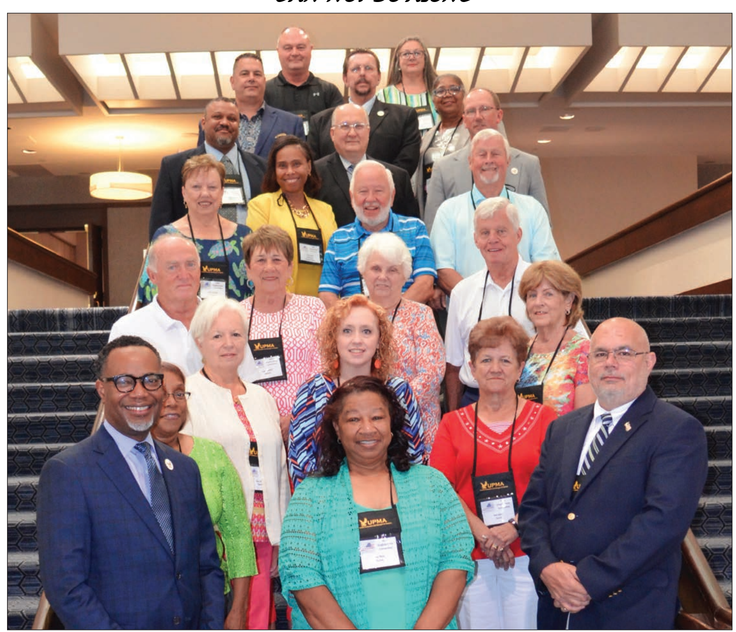
2021 UPMA STATE CONVENTION